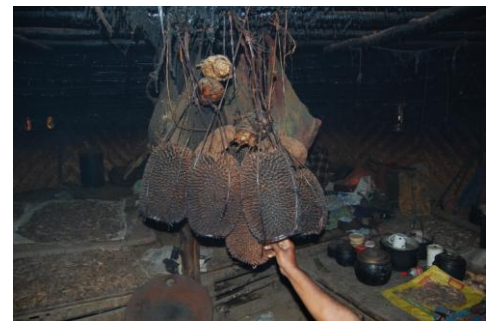
Karaku nut basket being made;