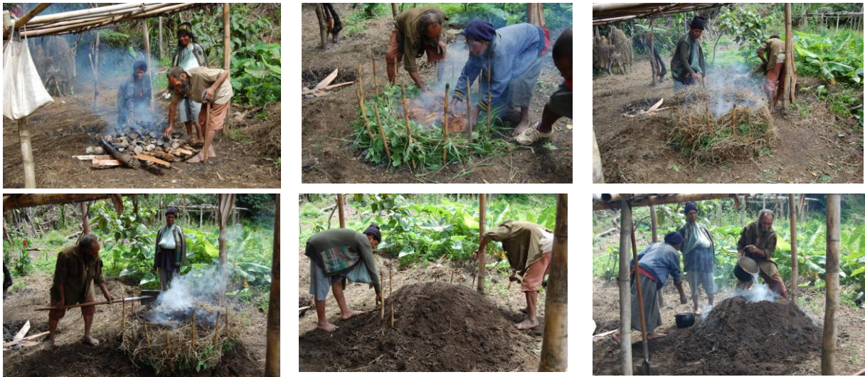
Figure 1. Making a mumu in Kaveve

Many participants from many highland areas referred to volume in describing the amount of water needed for a mumu cooking pit. The mumu is ubiquitous although the methods vary slightly within the highlands region while the methods for coastal areas are quite different. The Fore participants described the scene for a ceremony. The elders decide the amount by feeling the heat and decide how much water is needed. The bamboo is selected by its width and length of nodes. A Kamano-Kafe speaker put it the other way round “bamboo was measured by the amount needed for a mumu pit”. Bamboo lengths were used for carrying water to the mumu pit. The size of the pit and heat (resulting from the type and amount of wood used and stones) would determine the amount of water to be added to the covered heated stones until the steam rising from the watered stones slowed down and provided steam for the cooking. Figure 1 shows steps in the mumu preparation. In this case, the river was very close and five cooking pots were used.