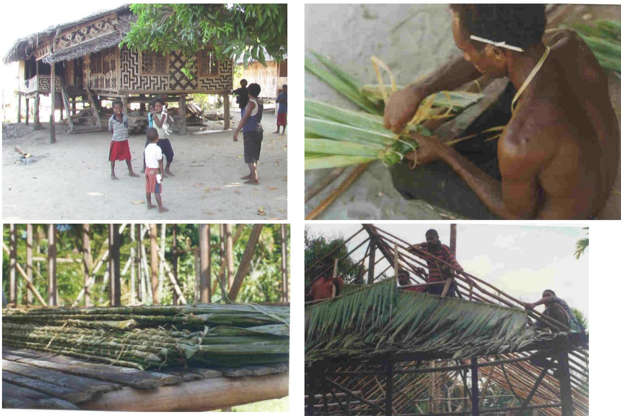
Figure 4. Coastal house on posts with morata on the roof (Malalamai) and in preparation for a new house (Kela, Morobe Province).

Similar comments are also made about the collection of sago leaves for houses in the coastal regions. Malalamai noted that they can look at the limbom palm and know how many planks they can make for roofing. They can tell if a pile of morata (sago leaves sewn over limbom timber as roofing) is sufficient for half a roof of a particular house (Figure 4). (This is a recent innovation that spread from other places in the Pacific and around PNG). The Panim men commented that “they start the house by collecting the sago leaves and making the morata for the roof. For a 9 post house they will select five very big sagos ready to eat and more for a 12 post house, may be nine. If it ends up being insufficient, they will get more later. The morata are about one and a half arm spans long. This will influence the size of the house and a bamboo will be used to keep this length.”